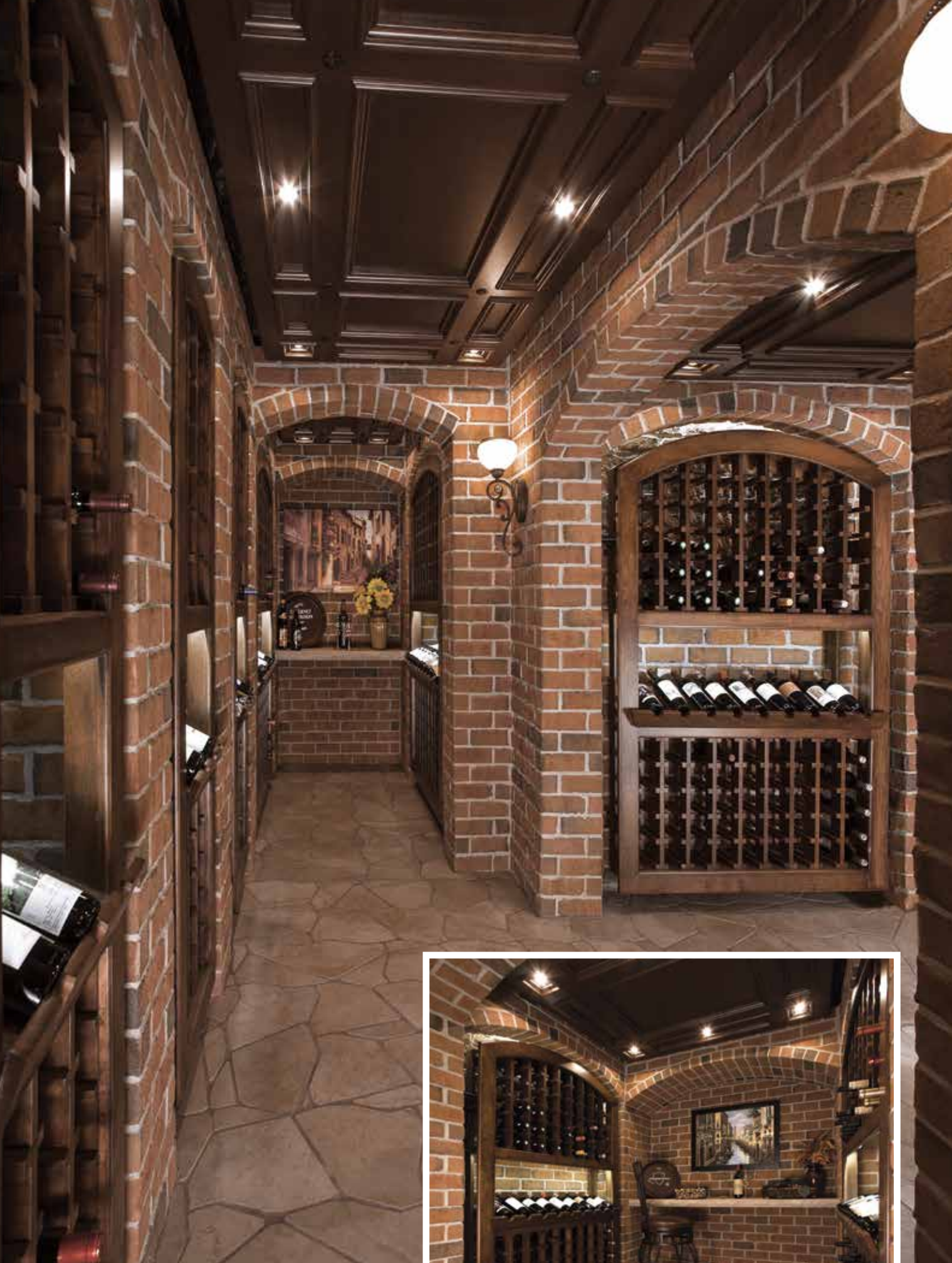
La Salle Thin Brick*