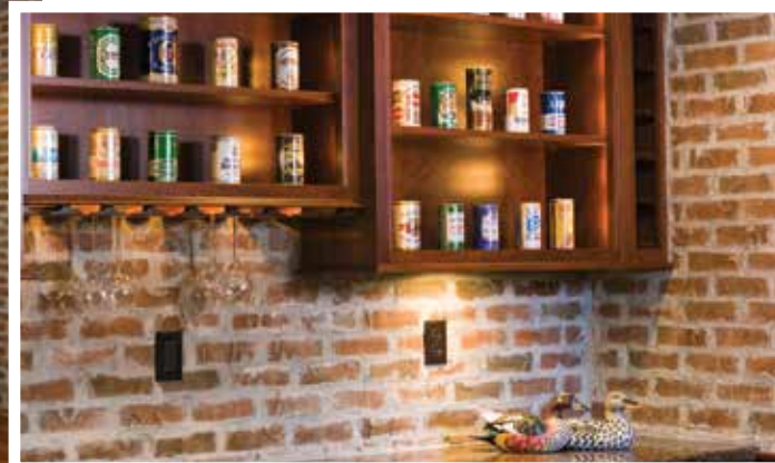
Stratford Thin Brick