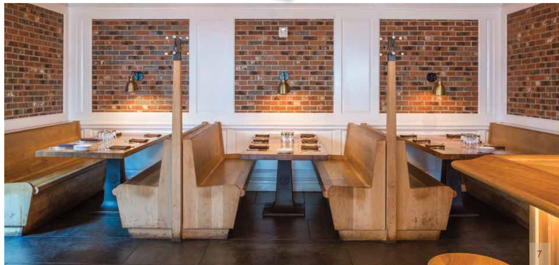
Flagstaff Thin Brick