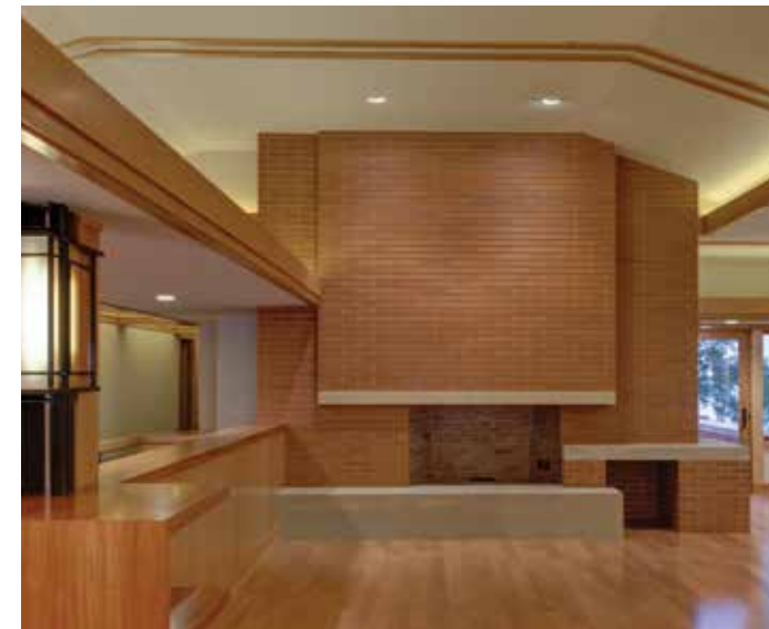
Red Colonial Norman Thin Brick*