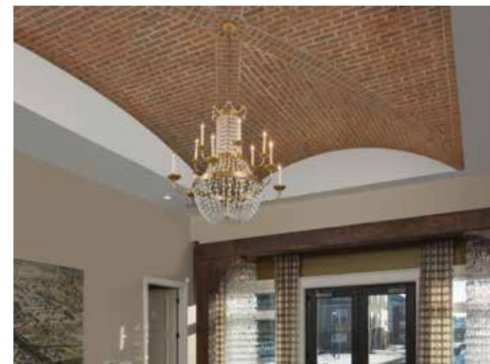
Stratford Thin Brick