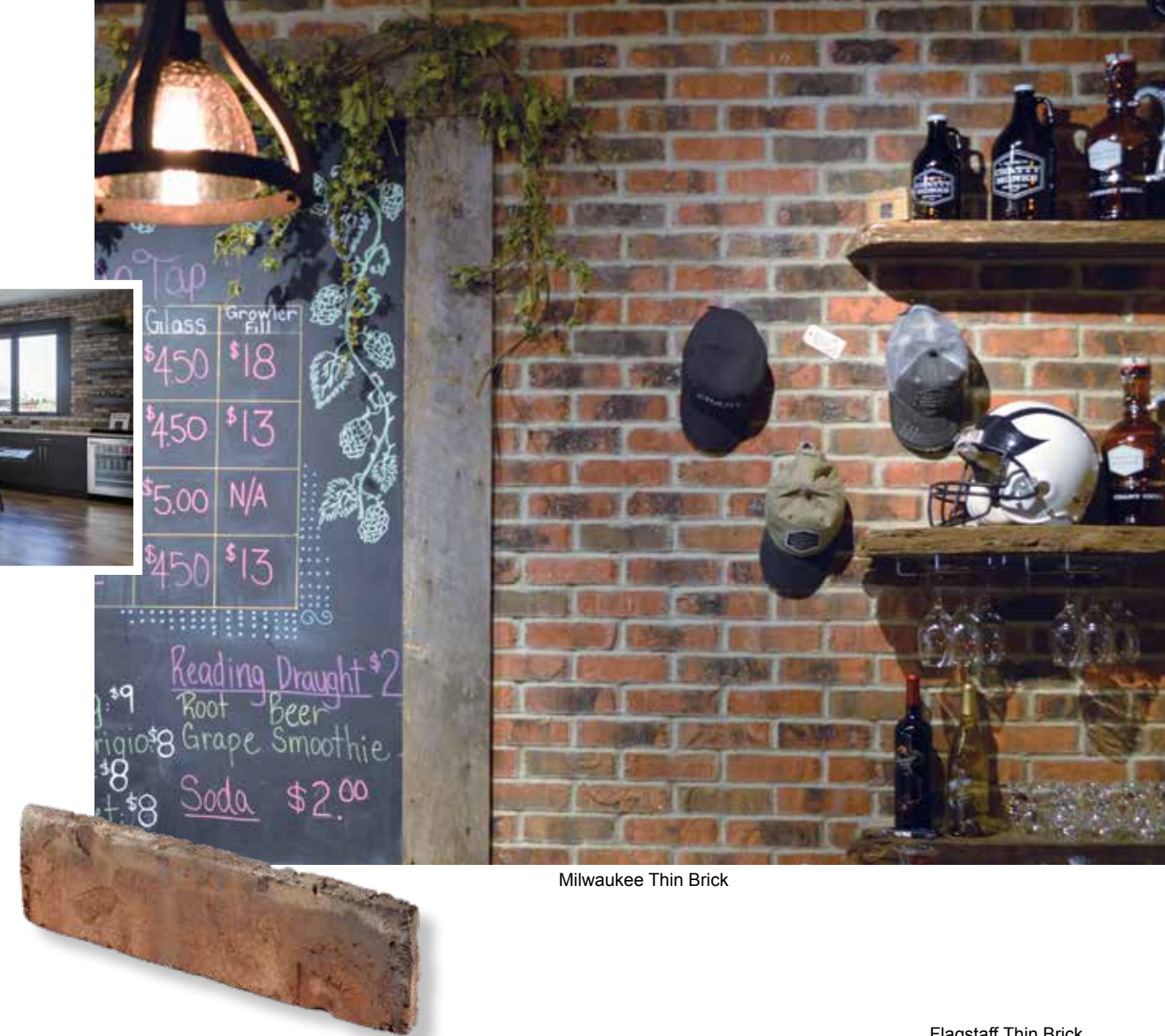
Milwaukee Thin Brick