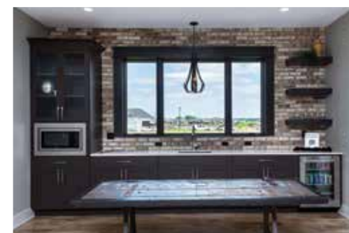
Silverbrook Thin Brick