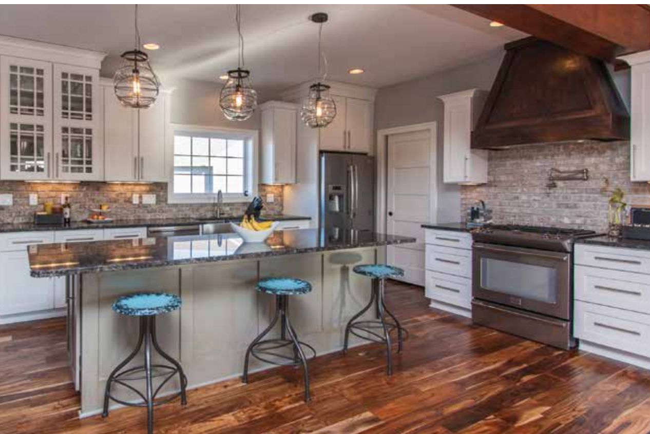
Nob Hill Thin Brick

This lightweight product requires less supporting structure, allowing for installation almost anywhere including ceilings and floors. Our all natural, sustainable products are available in a large color palate. Unique installation options complement any style making it a great addition to any interior design scheme from modern to rustic and more!