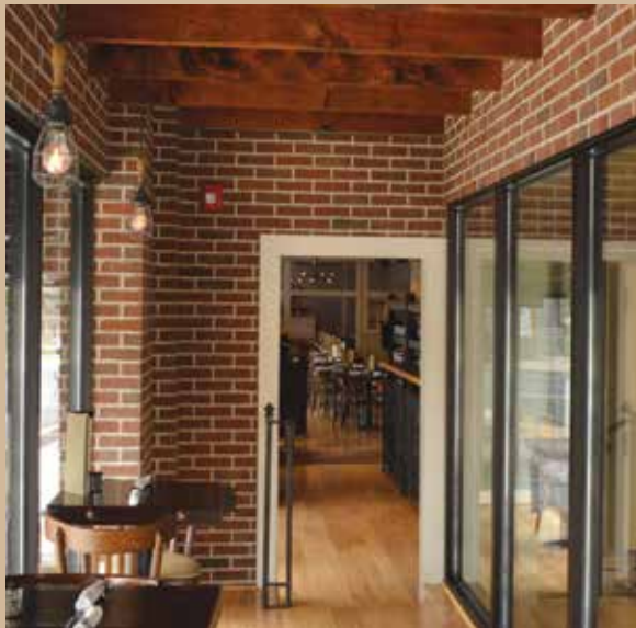
Aberdeen Thin Brick installed with Thin Tech®